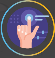
GUI Touch Screen