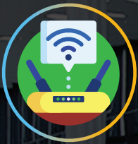
5G/4G wifi LAN Port