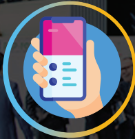
DCN Mobile App